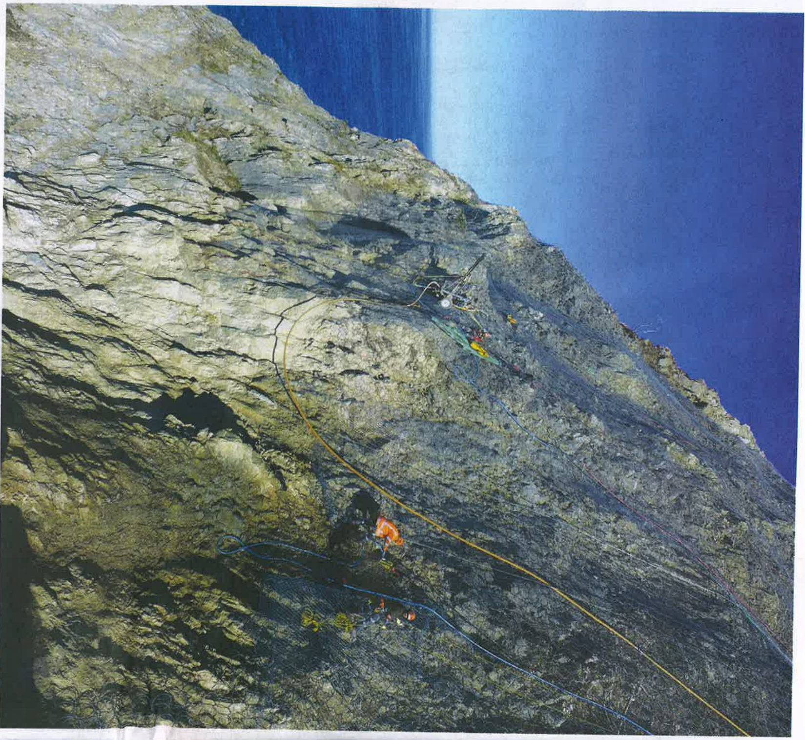
After installing the ring net and mesh drape, which covers the top 4500sqm of the rock face, the crew removed the loose rocks from the base of the drape down to the road level, an approximately 12,500sqm area.

"It's just another indication of the high levels the business is operated at in all levels underpinned by our core values – pride, honesty, respect and drive."