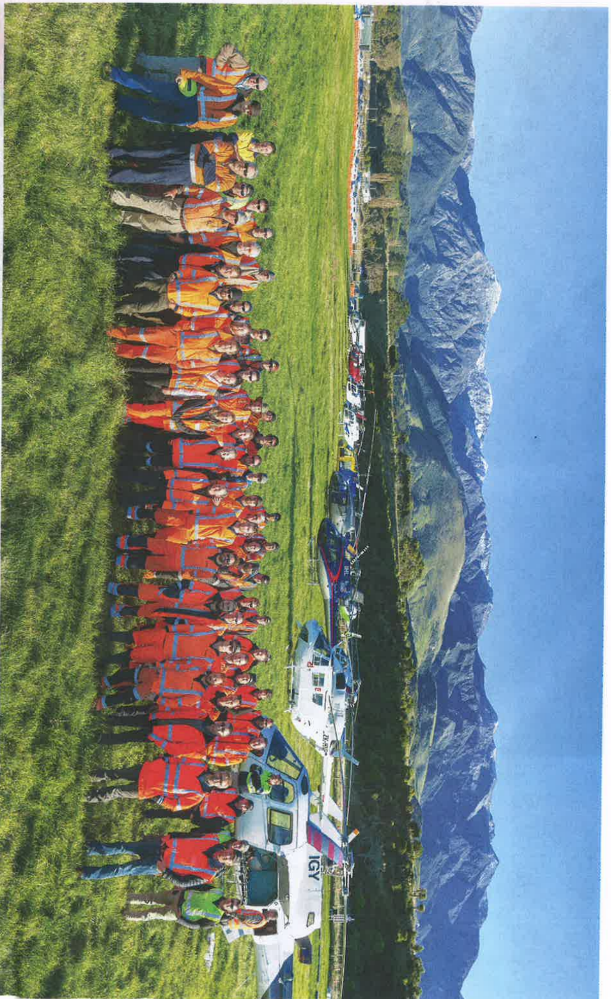
The Hiway Group has established a joint venture Hiway Geostabilization with GSI from the US to assist with the disaster recovery of the Kaitioura earthquake.