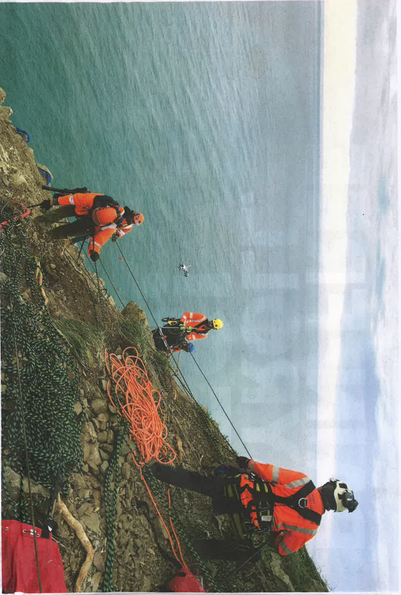
HGS absellers have been securing the rock face at Ohau point with ring nets, high-tensile steel mesh and rock bolts.